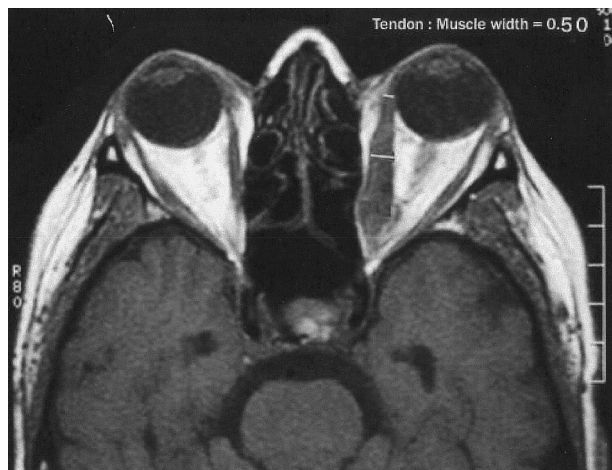
FIGURE 2. Moderate to severe involvement of muscle tendon on magnetic resonance imaging scan of a patient with thyroid-associated orbitopathy (fusiform enlargement, tendon/muscle ratio 0.50).

T ENDON-SPARING EXTRAOCULAR MUSCLE ENLARGEMENT is considered pathognomonic for thyroid-associated orbitopathy (TAO), whereas tendon involvement is thought to be more characteristic of idiopathic orbital